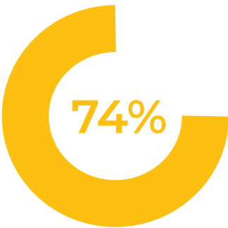
of Independents agree